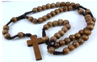
R1000 WOODEN ROSARY $10.00