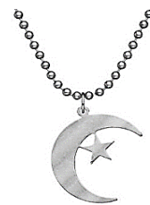
N1001 STAR & CRESCENT NECKLACE $30.00