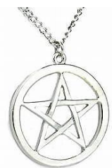
R1003 PENTAGRAM NECKLACE $15.00