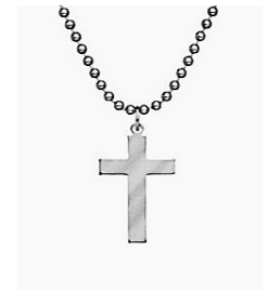
P1020 PROTESTANT CROSS/BEADS $30.00