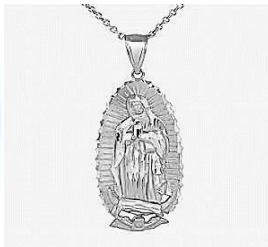
R1001 VIRGIN OF GUADALUPE $15.00