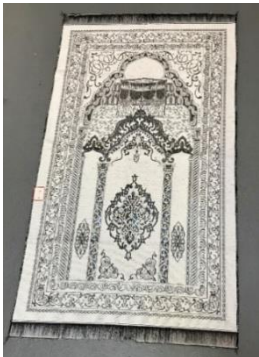
SA-001 MUSLIM PRAYER RUG $16.00