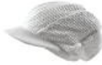
A1006 RASTA HAT $25.00