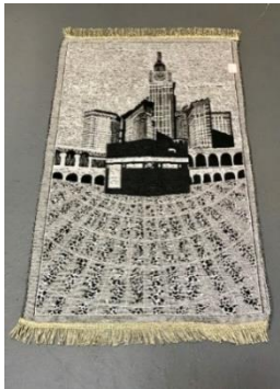
XN-005 INTERFAITH PRAYER RUG $16.00