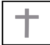
M1004 WHITE ALTER CLOTH CROSS $25.00